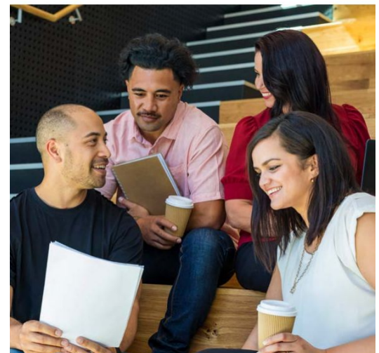
New Zealand School Trustees Association Te Whakaroputanga Kaitiaki Kura O Aotearoa