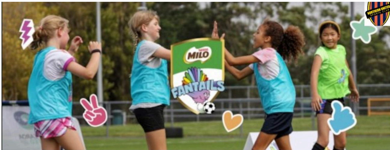
Calling all aspiring young female footballers!

We are often asked to put Community Notices in our newsletter. Due to the large number of requests, we now have a "Community Notices" section on the notice board in the School Office, where you will find more information on the notices below. Please note that this does not necessarily imply School endorsement of these notices.