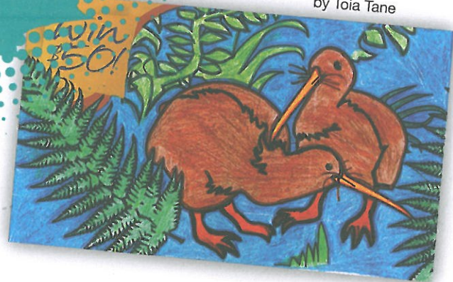
by Toia Tane